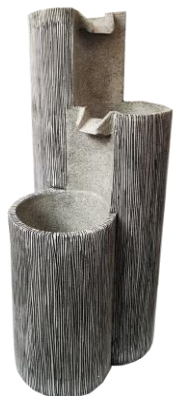
Fountain (LED lights pre-installed) 1x