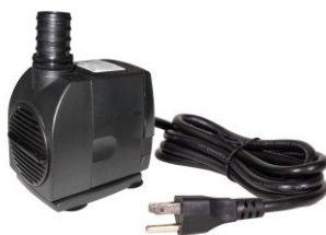
Fountain Pump 1x