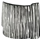
Fountain Back Door 1x