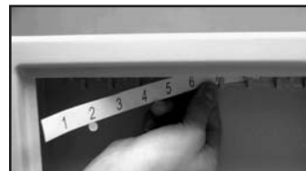
Installing number guides