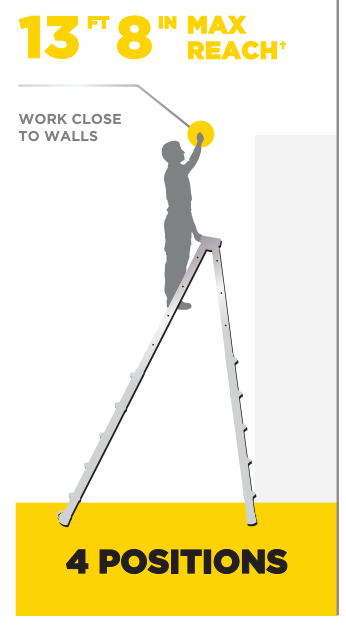
†Based on a 5<sup>FT</sup>6<sup>IN</sup> person with 12<sup>IN</sup> reach