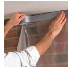
Hanging poly sheeting