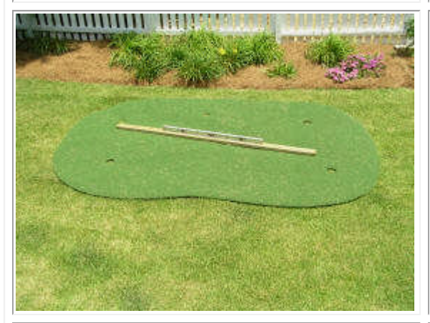
(2) Roll out green and check grade. Grade should not exceed a 2" rise over a 10' run