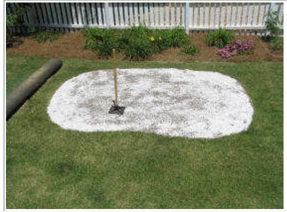
9) Compact the base with a hand tamper. A base of #8 crusher rock mixed with paver sand is used because it is resilient and holds it's shape better than pure sand.