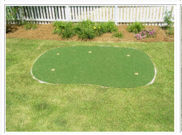
(12) Roll out green and check smoothness and contours