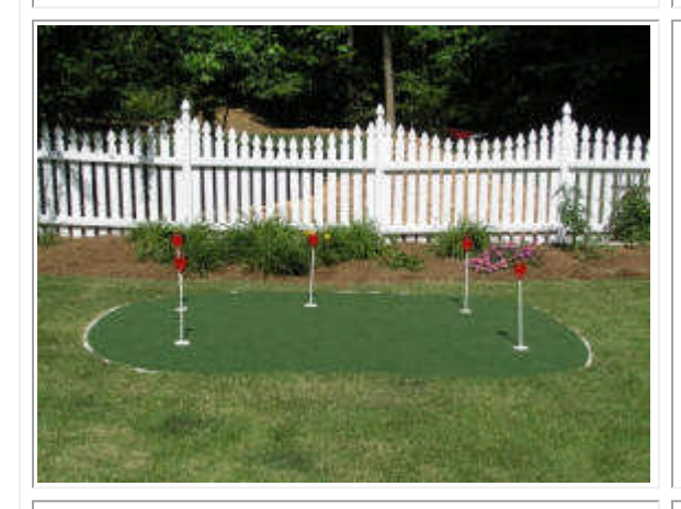
(18) To change the contours of the green over time, add a bag or two of paver sand to keep the green challenging and fun for years to come.