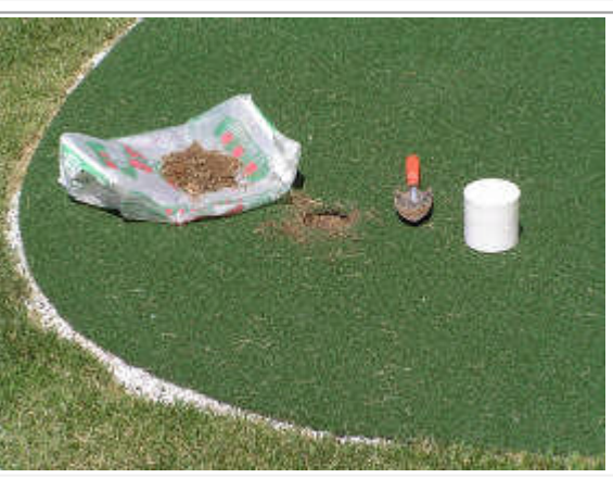
(13) Dig in cups with hand trowel or 4 ¼" hole cutter. OPTIONAL: If drainage may be an issue, dig 2-4 inches deeper than the length of the cup and add gravel. Top of the cup should be 1/8" below surface of the green.