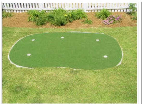
(16) Roll out green and inspect contours and level cups. Cups can be leveled by stepping gently on their edges.