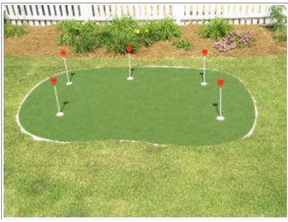
(17) Clean and add markers or flags (optional). Surface can be raked (leaf or carpet rake), blown, vacuumed with a beater bar or hosed off or gently pressure washed.