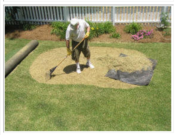
6) Rake or blow cuttings from outlined area, and cut ridges or roots if necessary. Fill any indentations