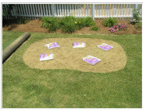
7) Add up to 2 lbs. of base for every square foot of green. #8 crusher rock mixed evenly with sand (1 to 1) is recommended for base