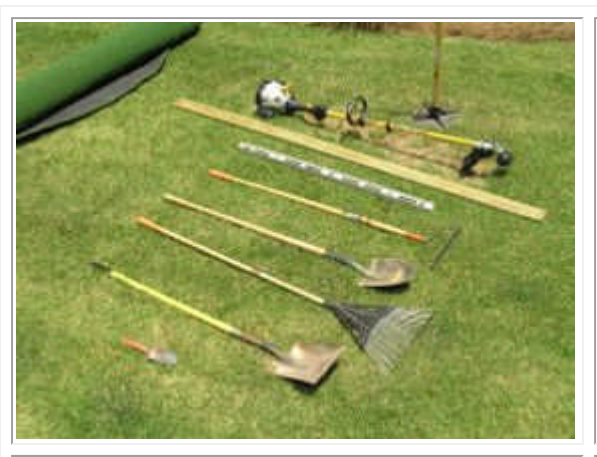
Hand tamper, string trimmer, safety glasses, 2x4, 3 foot level, yard rake with flat metal side, round nose shovel, leaf rake, square nose shovel and hand trowel

Follow the step-by-step instructions below to prepare the location and install your new putting green. Happy putting!