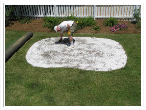
10) Check the base for levels and smoothness