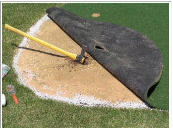
(14) If soil is too hard to dig in cups with a hand hand trowel (roots or rocks), mark hole and roll up green at hole. Then, chop up area by hole with a pick or round nosed shovel. Compact area flat and dig in hole.