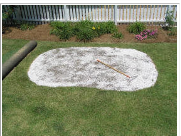
8) Create a gentle crown in the center for drainage with a leveling rake or 2x4 and rake the area smooth. No indentations should be present.