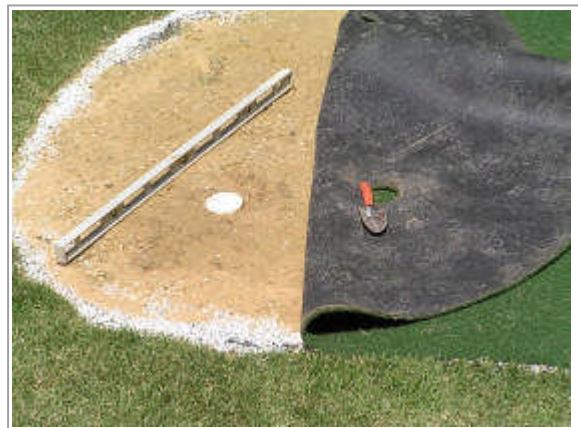
(15) After the cup is set in the ground, roll up green at hole and compact soil around the cup with the level.