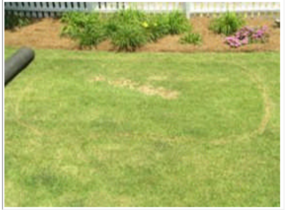
(4) Roll up green