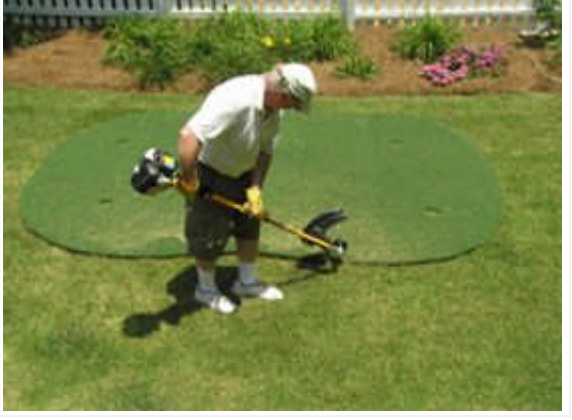
3) Outline edge of green with weed eater, or edger (always wear eye protection).