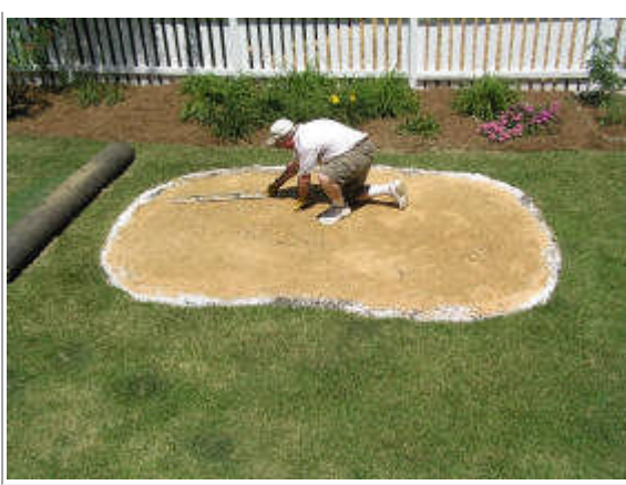
13) OPTIONAL: Additional paver sand can be added for smoothness or to create gentle contours in the green. Smooth with edge of level to final desired contour.