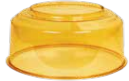
Domo de Poder 22050