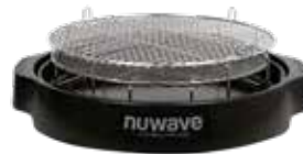
3-inch & 2-inch Cooking Rack