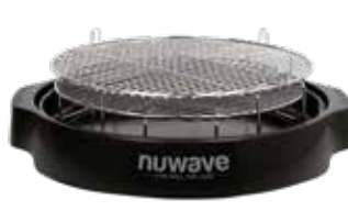
Rejillas para Cocinar de 3 y 2 pulgadas