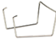
Asa para el Domo 22020