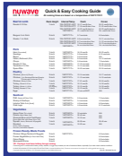
Guía de Cocina Rápida y Fácil en Inglés BQ 20600