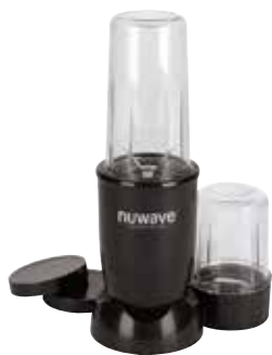
NuWave Twister 22091