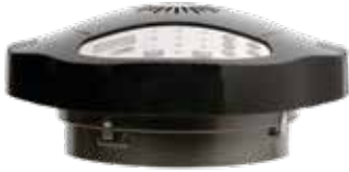
Fuente de Potencia Digital Negra con Detalles Plateados 26001