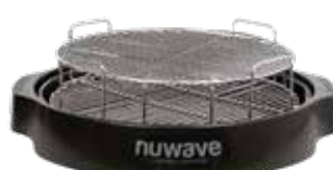
Rejillas para Cocinar de 2 y 1 pulgadas