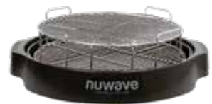
2-inch & 1-inch Cooking Rack