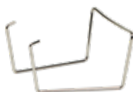
Dome Holder 22020