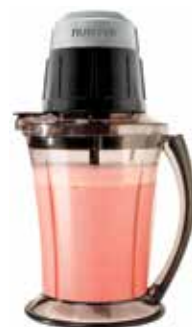
NuWave Party Mixer 22191

Para ordenar llame a nuestra Línea de Atención al Cliente al 1.877.689.2838 u ordene en línea en www.NuWaveNow.com . Favor de proporcionar el nombre y el número del producto para asegurar que su compra sea procesada correctamente.