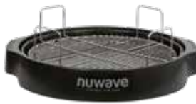
1-inch Cooking Rack