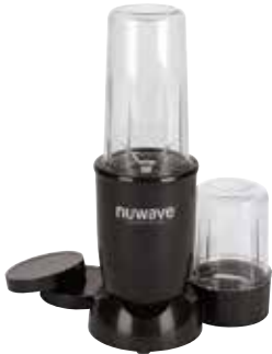
NuWave Twister 22093