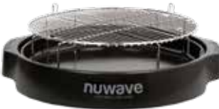
3-inch Cooking Rack

The Stainless Steel Extender Ring should not be cleaned with any harsh abrasive, but it is dishwasher safe.