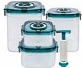
Flavor-Lockers® with Vacuum-Seal Technology