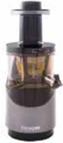
Nutri-Master® Slow Juicer