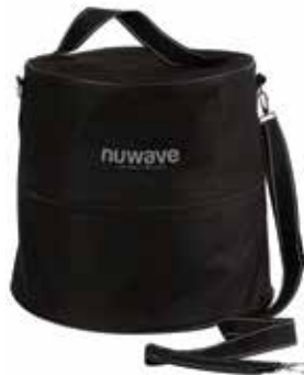
NuWave Pro Plus Carrying Case 26016

To order, call our Customer Service Line at: 1.877.689.2838, or order online at www.NuWaveNow.com . Please provide the item name and number to ensure that your purchase is processed accurately.