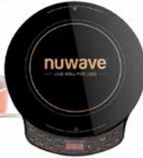
NuWave PIC® Gold Precision Induction Cooktop