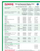
Guía de Cocina Rápida y Fácil en Español BQ 20600