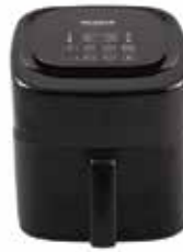
NuWave Brio® 6Q Digital Air Fryer