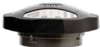
Digital Power Head 26001 Black with Silver Accents