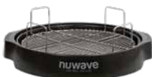
Rejilla para Cocinar de 1 pulgada