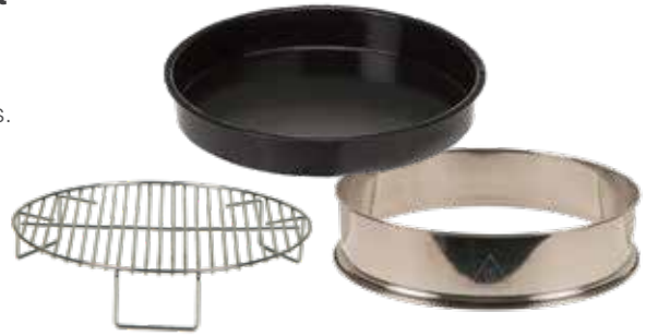
2-inch Cooking Rack