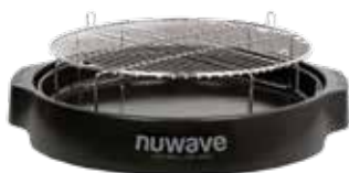
Rejilla para Cocinar de 3 pulgadas

El Aro Extensor de Acero Inoxidable no debe ser limpiado con ningún limpiador cáustico, pero es seguro para lavar en el lavavajillas.