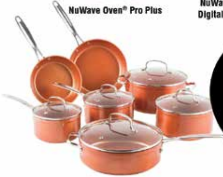
Duralon® Healthy Ceramic Non-Stick Cookware