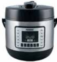
NuWave Nutri-Pot® 6Q Digital Pressure Cooker