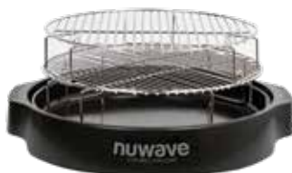
Rejillas para Cocinar de 2 y 3 pulgadas