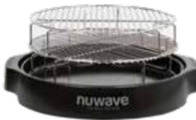
2-inch & 3-inch Cooking Rack