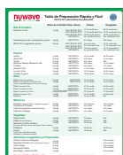
Spanish Quick & Easy Cooking Guide BQ20600