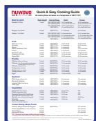
English Quick & Easy Cooking Guide BQ20600