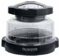
NuWave Oven® Pro Plus