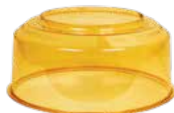
Power Dome 22050