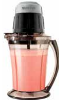
NuWave Party Mixer 22193