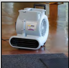
Entryway / Walk Off Mat