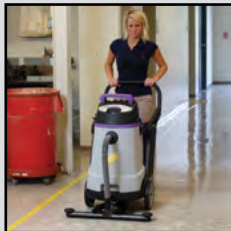
Extreme Weather Condition