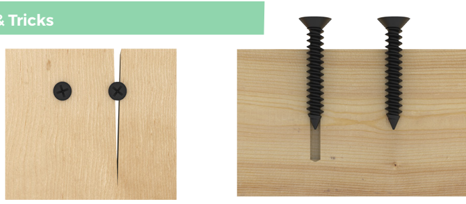
Pre-drilling is highly recommended to prevent splits