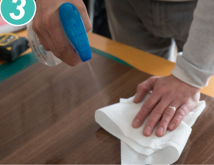
Clean thoroughly to remove any grease and dust