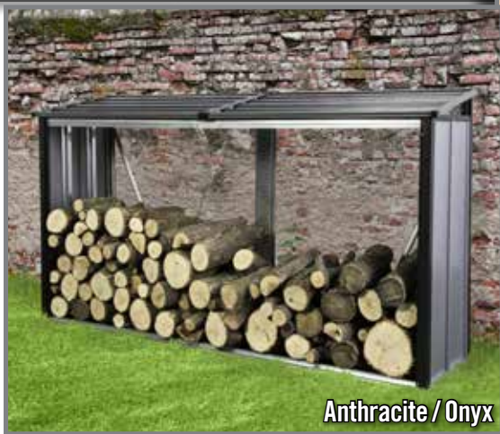
Anthracite / Onyx