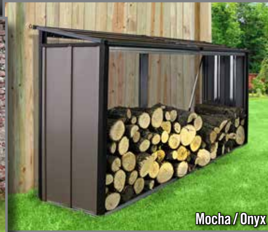
Mocha / Onyx