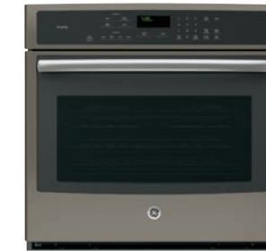
BUILT-IN SINGLE WALL OVENS*