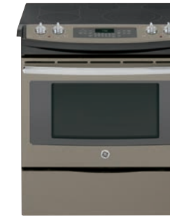
ELECTRIC SLIDE-IN SINGLE OVEN*