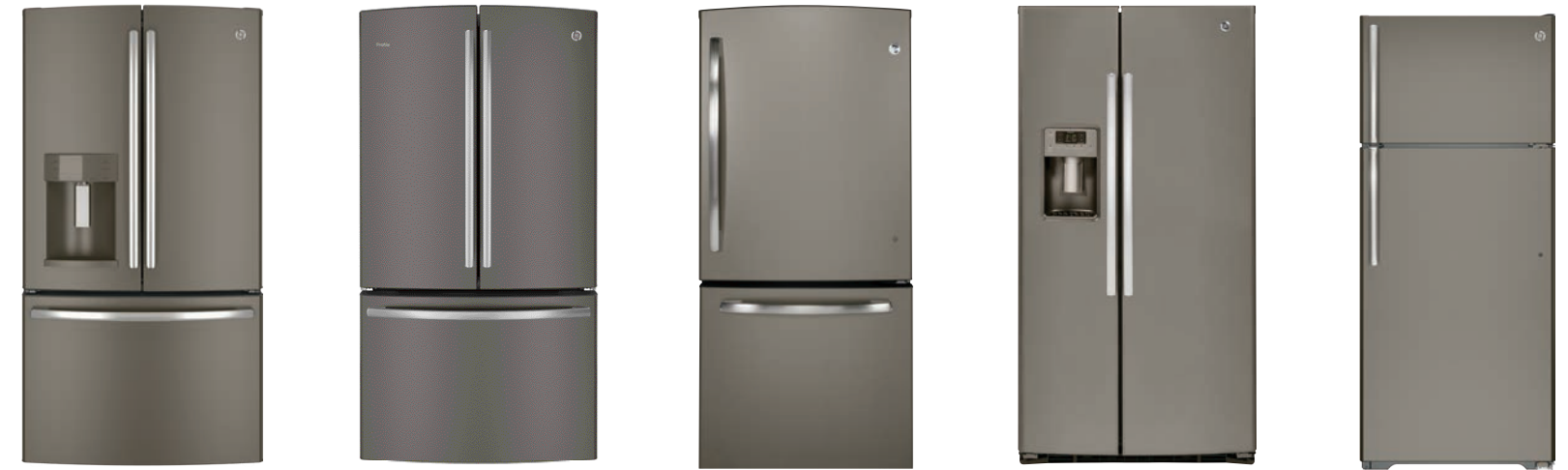
FRENCH-DOOR WITH ICE AND WATER DISPENSER

Add a truly unique look to your kitchen with a Slate refrigerator. Unlike stainless steel, Slate holds magnets. So you can easily display art projects, photos and this week's to-do list.