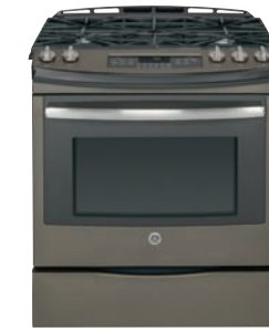
GAS SLIDE-IN SINGLE OVEN*