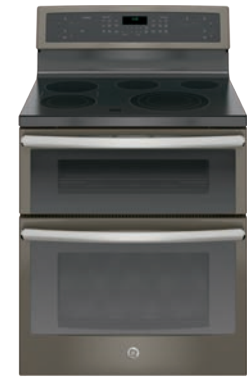
ELECTRIC DOUBLE OVEN