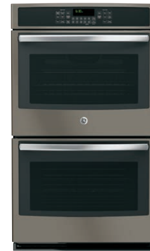
BUILT-IN DOUBLE WALL OVENS*

There's no easier way to get a sleek look than with a Slate hood or wall oven. Slate wall ovens also pair beautifully with stainless cooktops. It's a custom look that satisfies your epicuriosity.