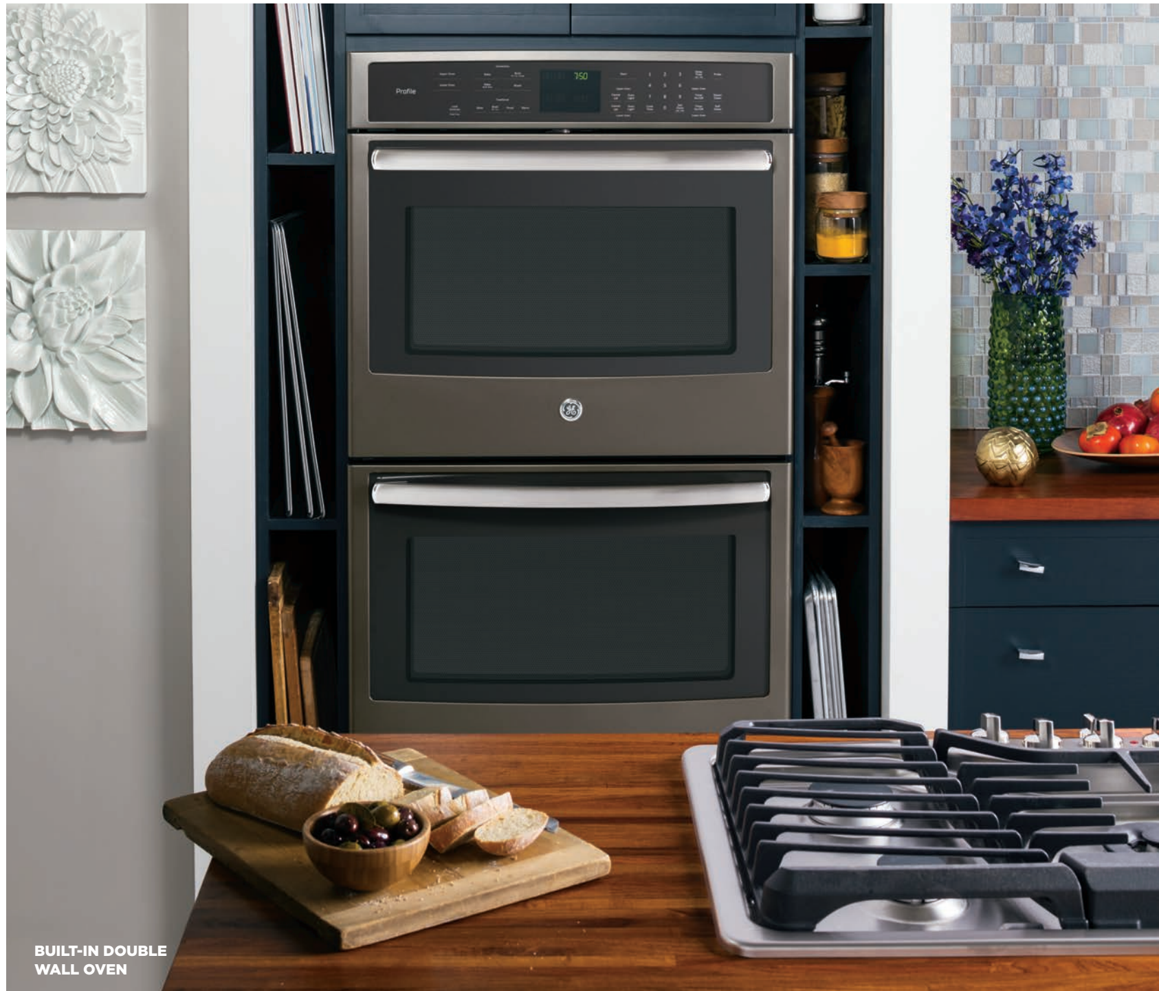
BUILT-IN DOUBLE WALL OVEN