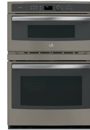
COMBINATION DOUBLE WALL OVEN*