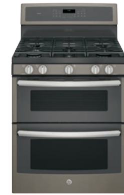
GAS DOUBLE OVEN