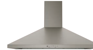
PYRAMID CHIMNEY HOODS*