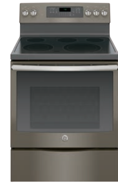
ELECTRIC SINGLE OVEN