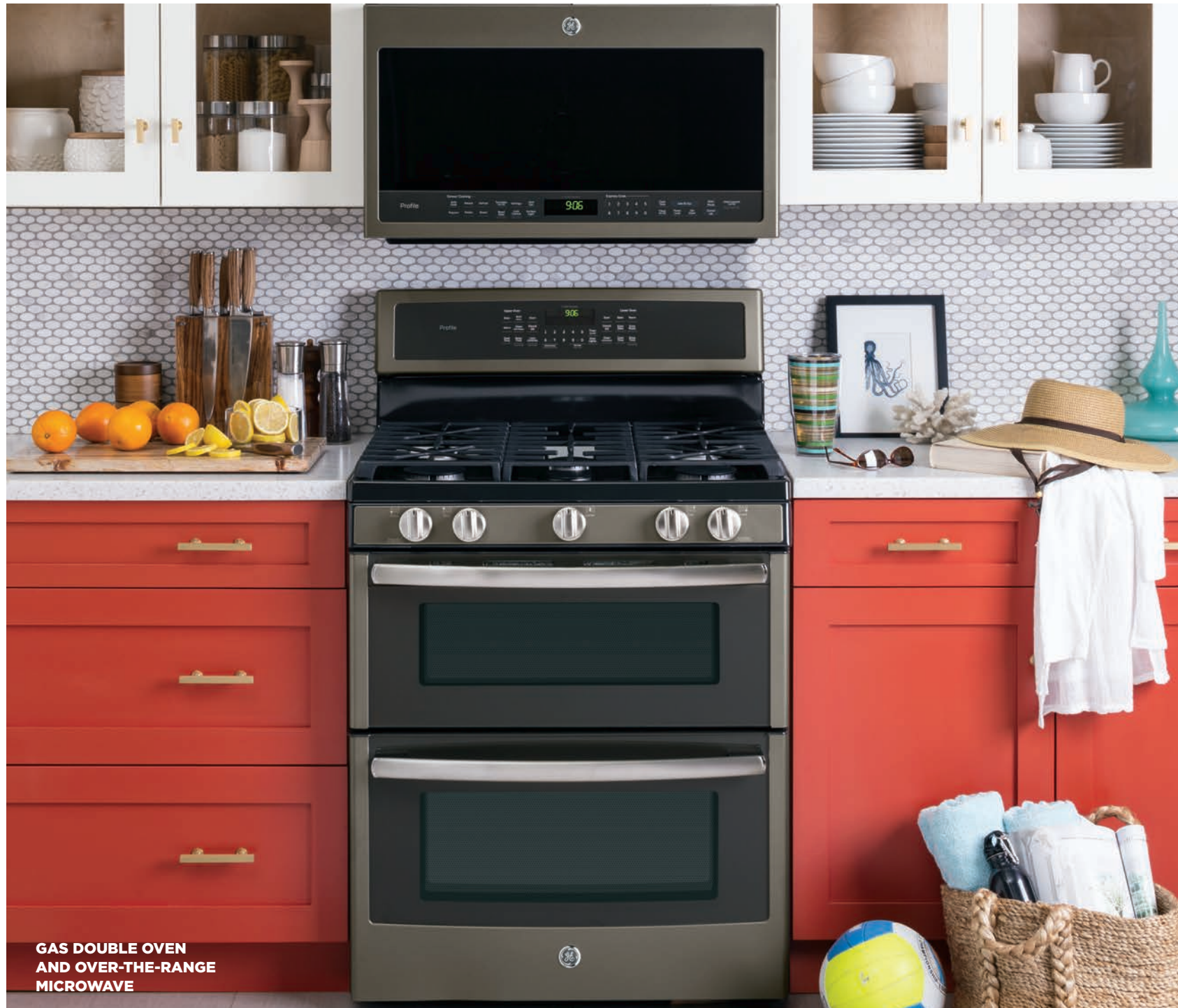
GAS DOUBLE OVEN AND OVER-THE-RANGE MICROWAVE