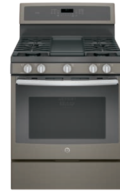
GAS SINGLE OVEN