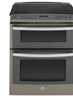
ELECTRIC SLIDE-IN DOUBLE OVEN*