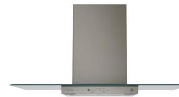
GLASS CANOPY CHIMNEY HOODS*