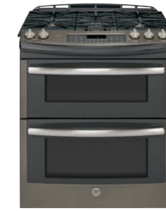
GAS SLIDE-IN DOUBLE OVEN*