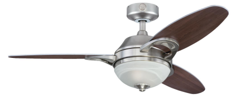
Reversible Weathered Maple Finish Blades