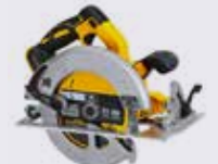
Circular Saw (if needed)