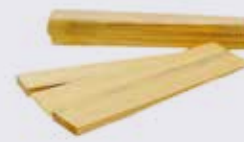
Shims or Spacers