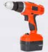
Drill with 3.32" Drill Bit and Phillips #2 Bit