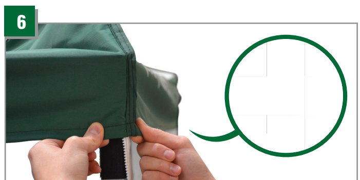
Carefully pull down the canopy top's corners from above the velcro area.