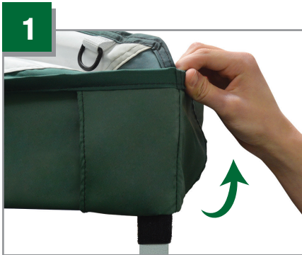
Carefully lift the canopy top's corners above velcro area.