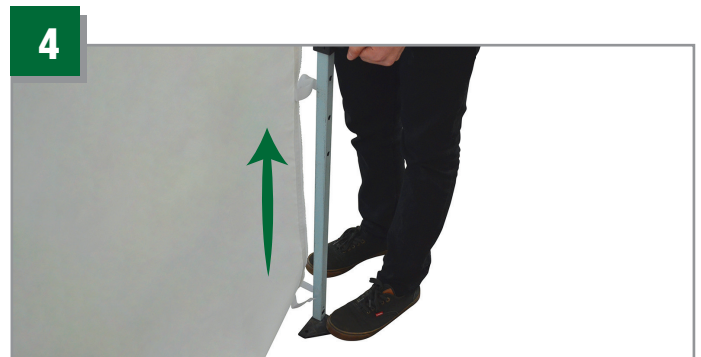
Extend the frame's legs to the desired height.