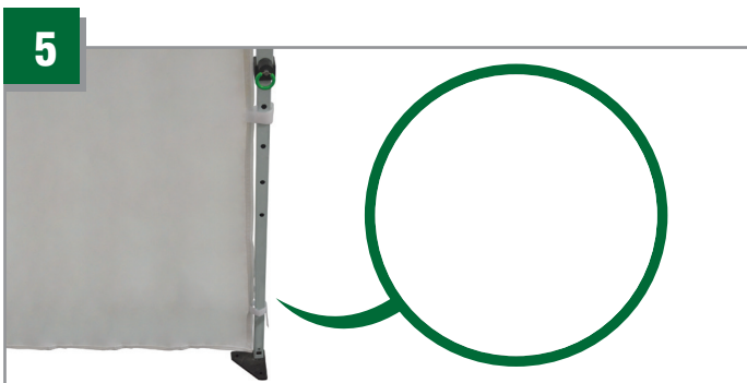
Attach the remaining velcro to the frame's legs.