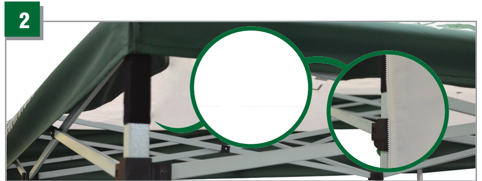
Attach the sidewalls to the vertical velcro located at the top of the frame's legs on each corner.