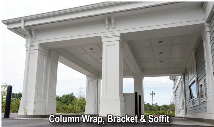
Column Wrap, Bracket & Soffit

Size Available: 8', 12', 16' long for 1" Trim / 8' long for 1/2"