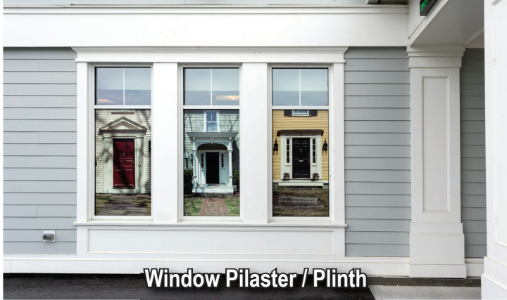
Window Pilaster / Plinth