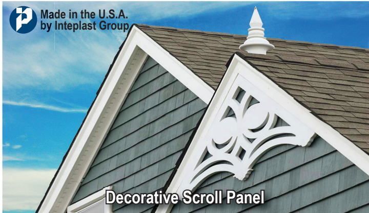
Decorative Scroll Panel