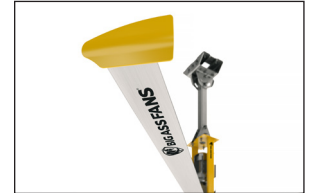
The unique aerodynamic design eliminates vortex formation at the airfoil tips.