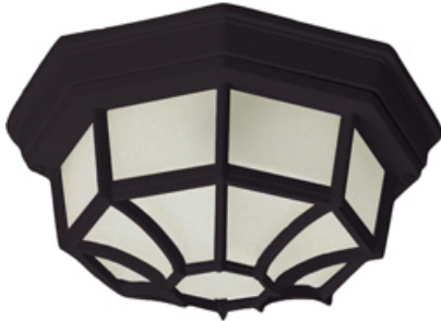
1020BK Crown Hill 2-Light Outdoor Ceiling Mount