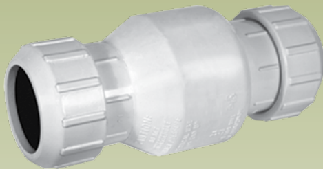
CVSE1, CV-SE2 and CV-SE3