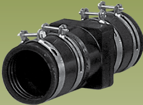
CV-114/112 and CV-SE