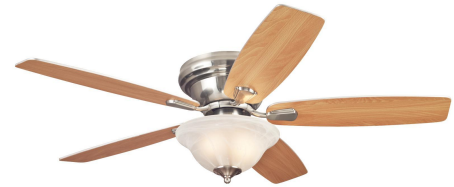
Reversible Beech Finish Blades