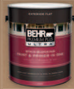
PREMIUM PLUS ULTRA®