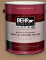
PREMIUM PLUS ULTRA®