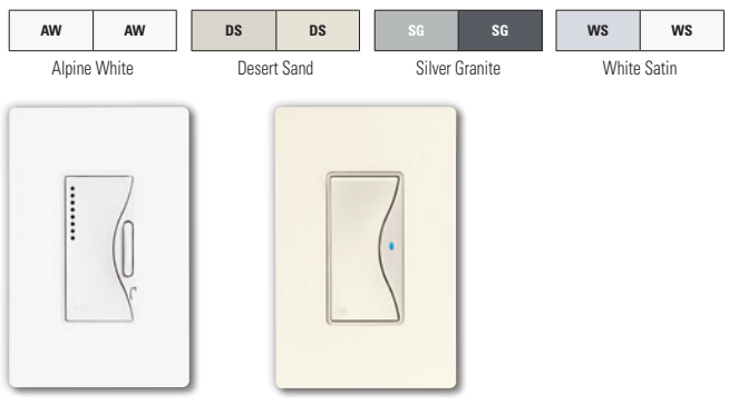
RF9540-NAW dimmer RF9501DS switch