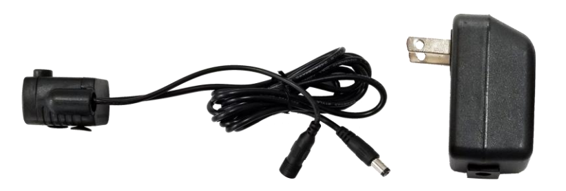
Fountain Pump 1x