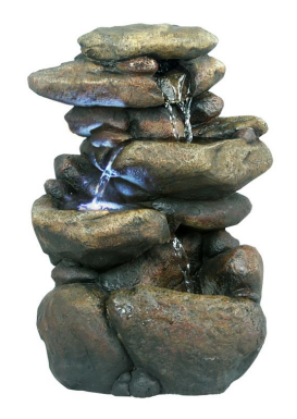
Fountain (LED Lights Pre Installed) 1x