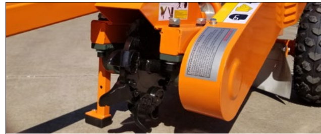
9 Carbide Cutting Head