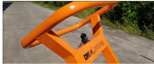
Adjustable Bow Handle With Heavy Duty Frame Mounting