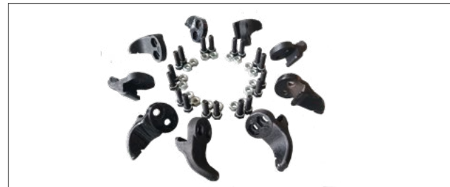
Extra Set Of Teeth Included