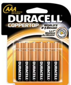
Representative Product Image/ Packaging

The battery products referenced in this PSDS document are consumer products. Under OSHA regulations, batteries are considered “articles” and are not subject to the OSHA Hazard Communication Standard MSDS/SDS requirements which apply for “hazardous chemicals in the workplace.” Additionally, batteries are considered “articles” under the Global Harmonized System and are exempted from the GHS labeling and SDS classification criteria. This PSDS document is provided as service in response to requests for information on battery use, safety and regulatory compliance.