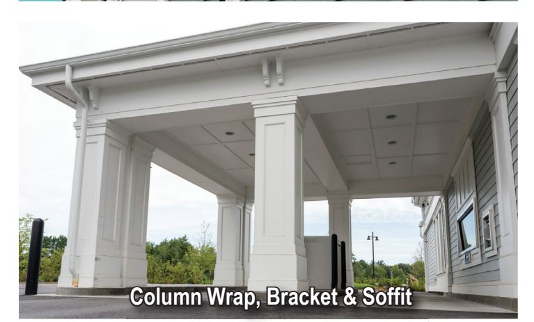
Size Available: 8',12',16' long for 1" Trim / 8' long for 1/2"