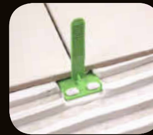
STEP 2 - A