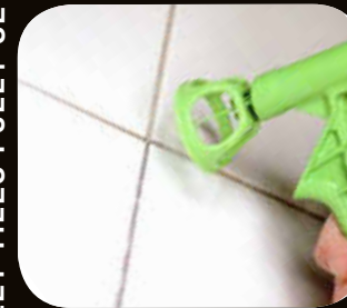
STEP 5 - WALLS