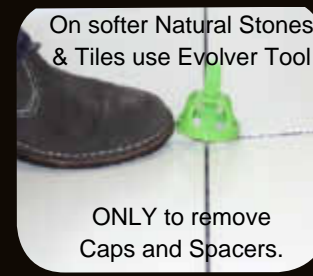
On softer Natural Stones & Tiles use Evolver Tool