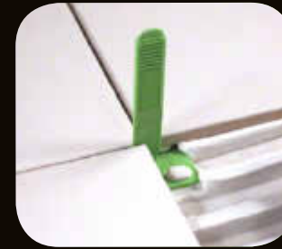
STEP 2 - B