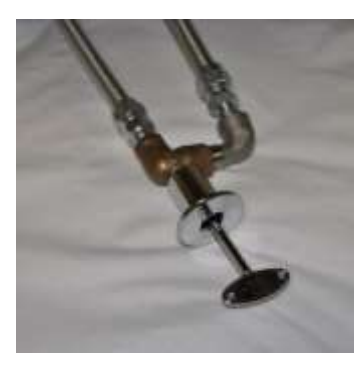
Key Valve Configuration

To reduce whistling ensure any flex line does not have sharp bends.