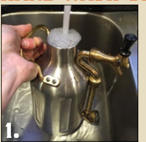
Remove cap and rinse uKeg with hot water (< 120° F).