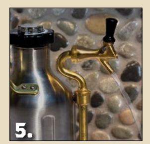
Install cap, charge briefly, flow a little water through tap, close tap.