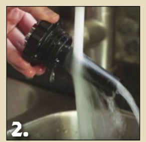
Rinse cap and sleeve with hot water (< 120° F).

DO NOT clean with basic cleaners like ammonia.