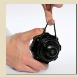
Stretch O-ring just enough for installation.