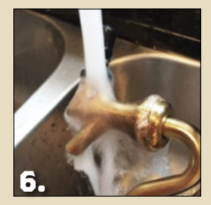
Empty bottle and rinse all parts.