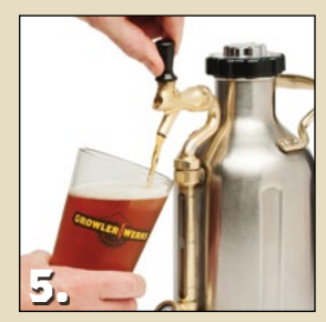
POUR AND ENJOY