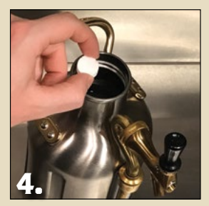
Fill with warm water under 120° F and 1 cleaning tablet.*