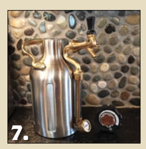
Allow to dry, and store with cap off and tap open in a dry place.