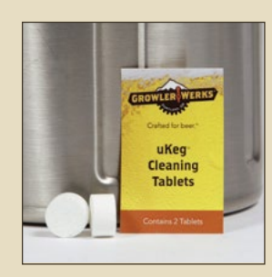
UKEG CLEANING TABLETS AVAILABLE AT GROWLERWERKS.COM