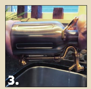
Shake with tap open, facing downward.