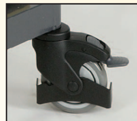
Swivel casters with toe guards