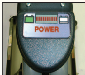
Battery status indicator