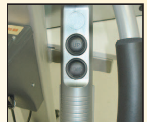
Two-button remote lift control