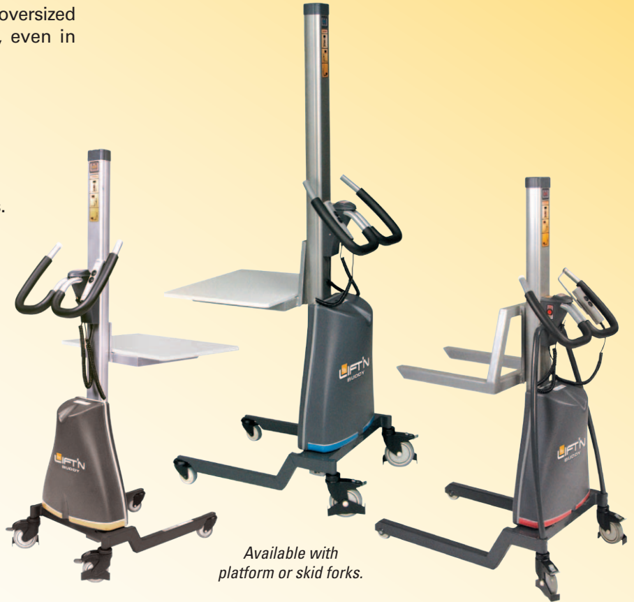
Available with platform or skid forks.