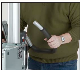
Comfortable padded grip handle