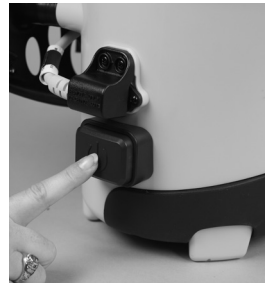
Turn off main power switch and unplug unit from wall outlet.