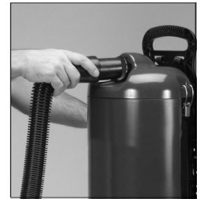
Remove vacuum hose from top of unit.