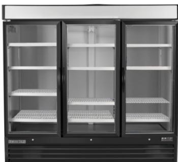
MXM3-72FB (Color: Black)

Glass door merchandisers are designed for durability and visual appeal in promoting your product. Glass door merchandisers are energy efficient and effective at keeping product at exactly the right temperature to preserve freshness, prolong shelf life and prevent freezer burn. Simple-to-use, programmable solid-state digital controls deliver accurate temperature regulation. An oversized refrigeration system provides energy efficiency, rapid recovery and consistent minimal change in the internal environment even if the door is opened frequently.