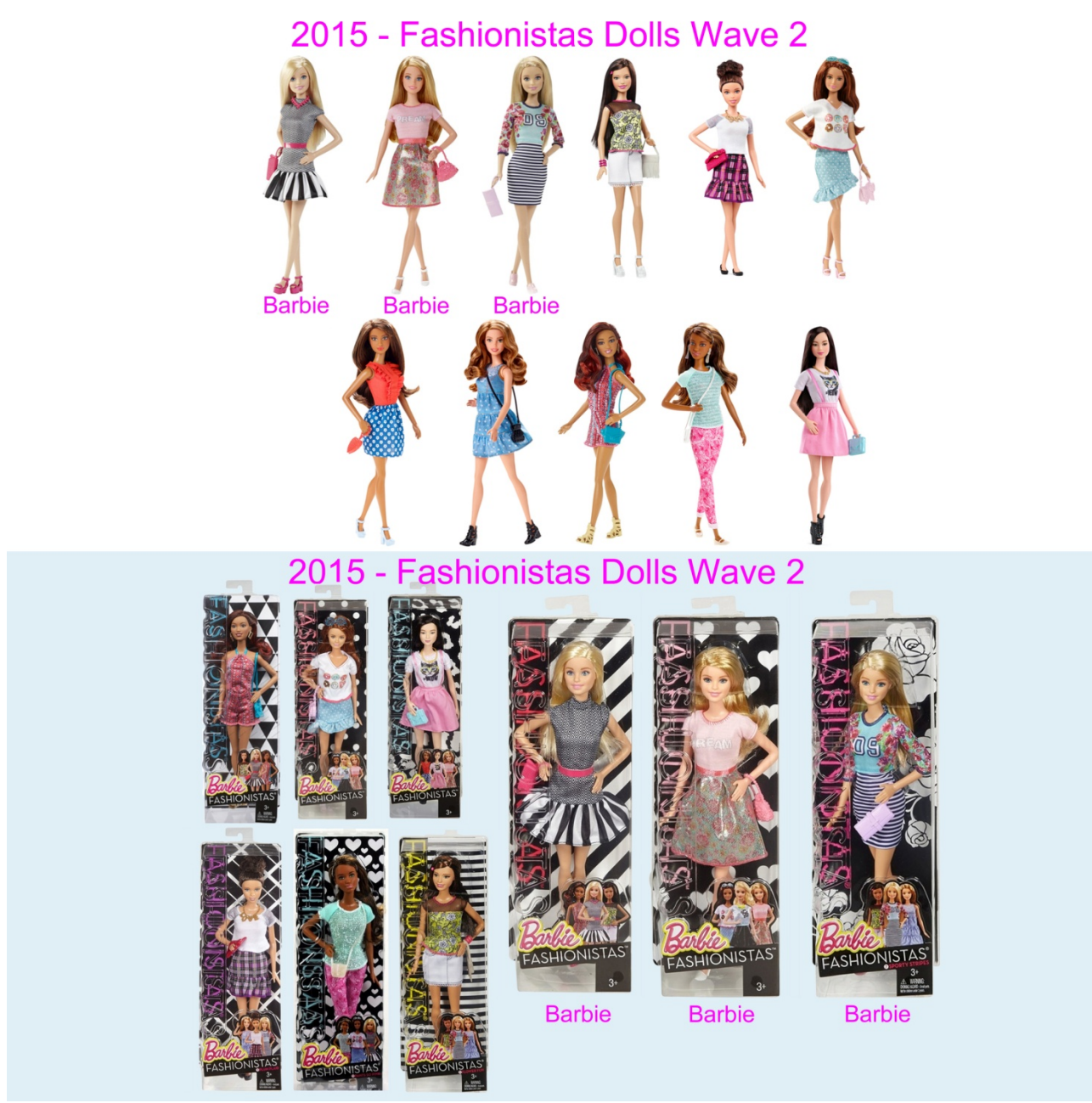
2015 - Fashionista Dolls 2015. Wave 2

This line arrived stores around February 2015 containing 11 dolls. Some of them are numbered and named after their clothing style.