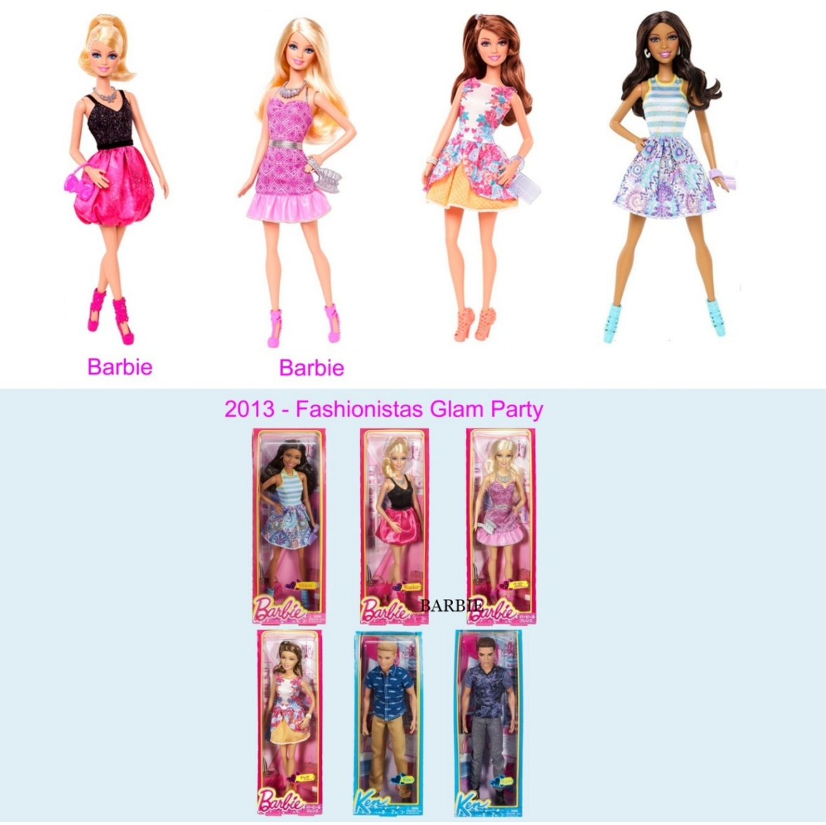
2013 - Barbie Fashionistas Glam Party

This wave arived in stores in September 2013 and contains two sublines: Glam Party dolls and Tropical dolls.