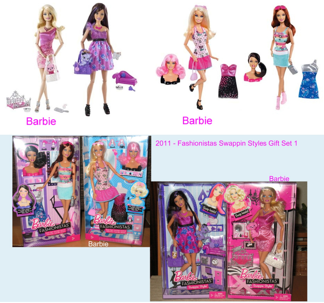
2011 - Barbie Fashionistas Swappin' Styles Wave 1 Gift Sets

These sets arrived in stores in the USA around September 2010 and in Europe around February 2011.