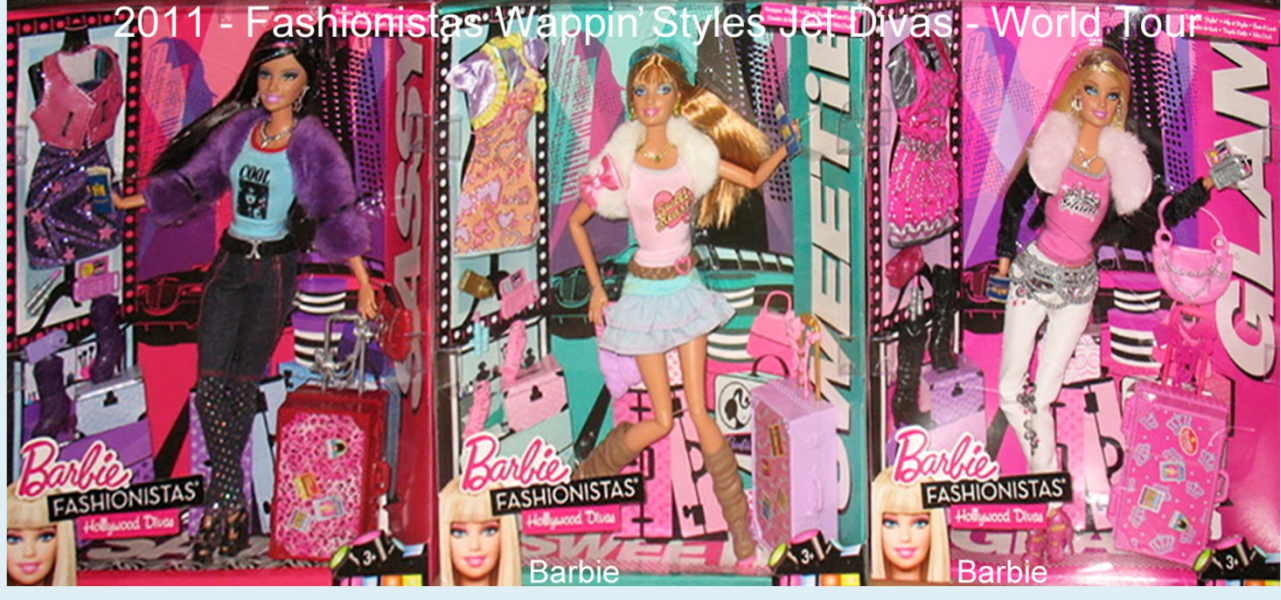
2011 - Barbie Fashionistas Swappin' Styles Jet Divas / World Tour

These sets arrived in stores in the USA around July 2011 and in Europe around September 2011.