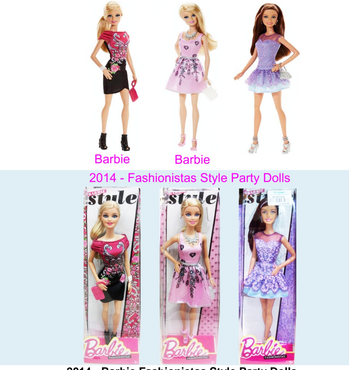
2014 - Barbie Fashionistas Style Party Dolls

This line arrived in stores around March 2014 and contains two Barbie dolls and a Teresa doll.