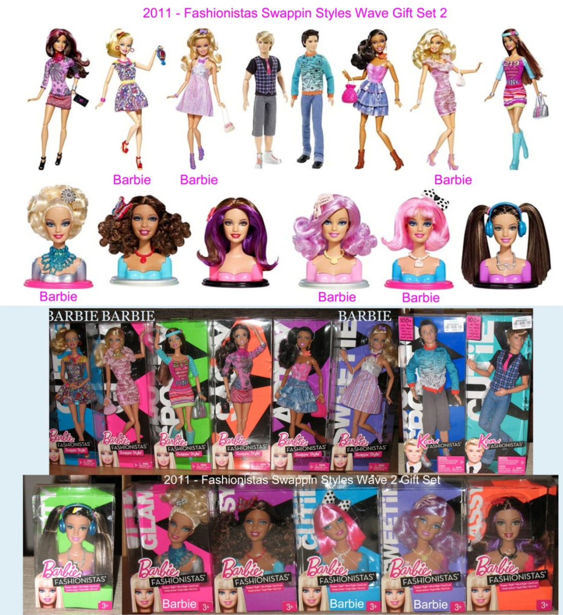
2011 - Barbie Fashionistas Swappin' Styles Wave 2 Dolls

This wave includes six female dolls (plus one extra head for each one, sold separately) and two male dolls: