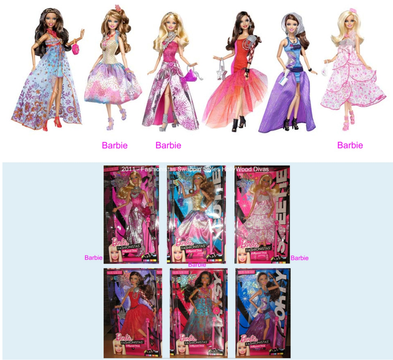
2011 - Barbie Fashionistas Swappin' Styles Hollywood Divas (In the Spotlight Dolls)

2011 - Fashionistas Swappin' Styles Holliwood Divas