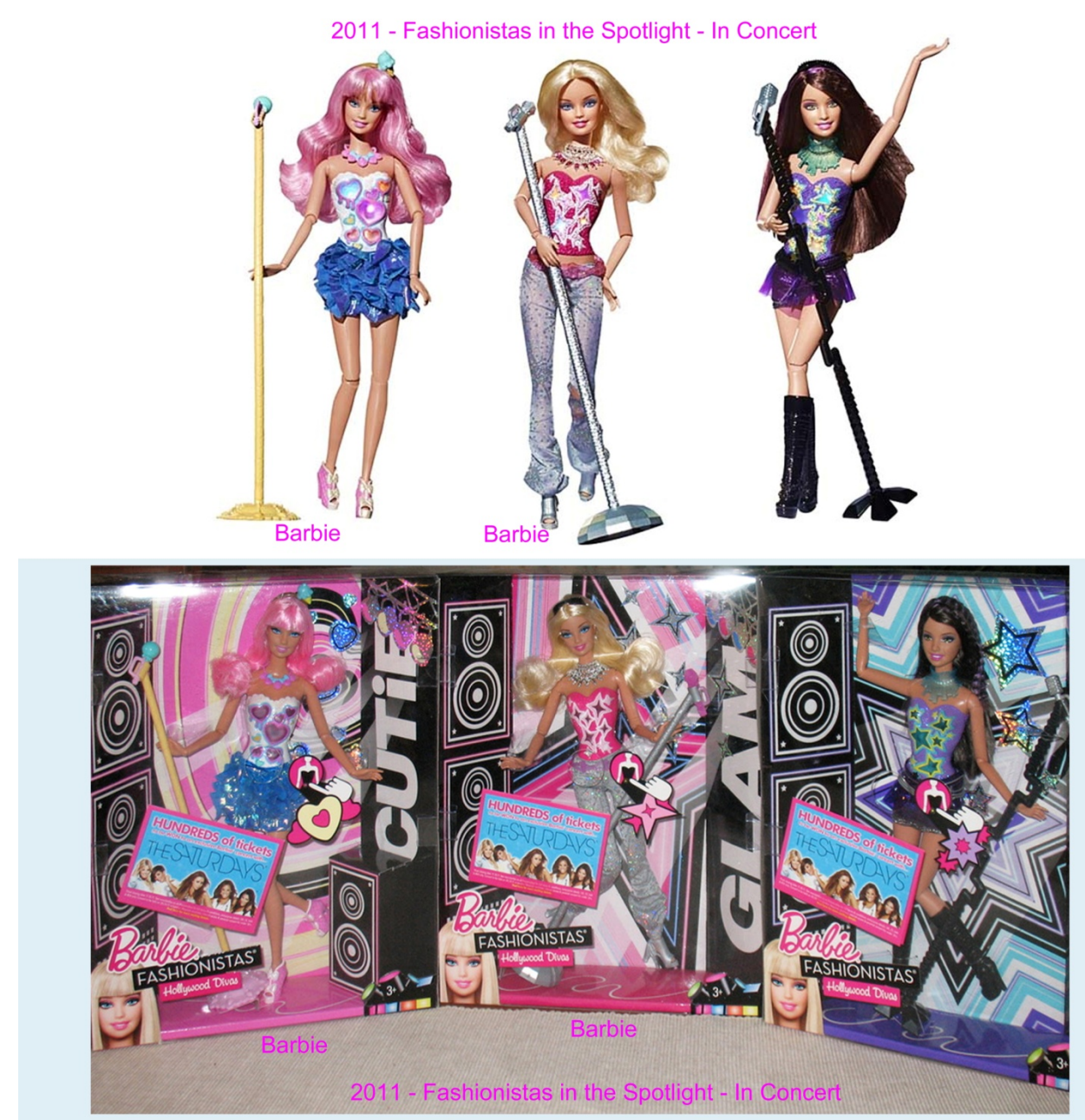
2011 - Barbie Fashionistas In the Spotlight. In Concert

These dolls arrived in stores in the USA around September 2011 and in Europe around December 2011.