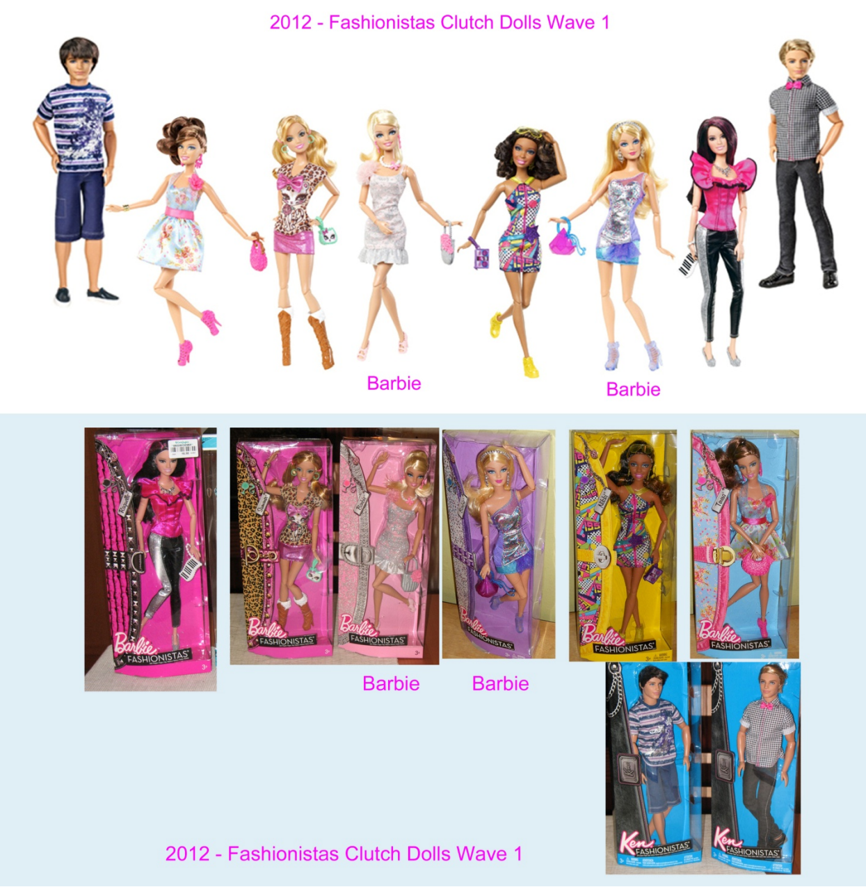
2012 - Barbie Fashionistas Clutch Dolls. Wave 1

This wave of dolls was released in the USA around November 2011 and in Europe around January 2012.