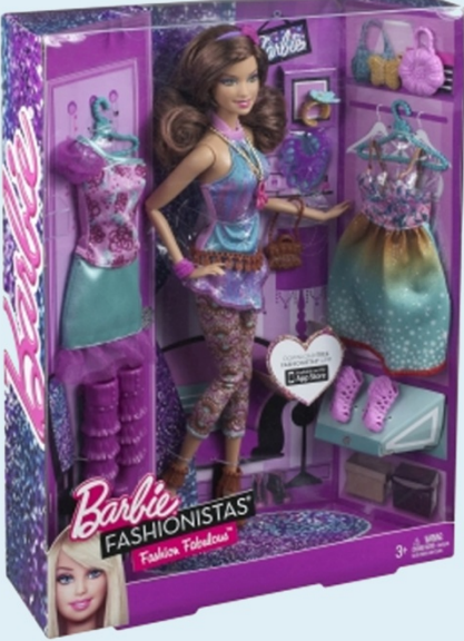
2013 - Barbie Fashionistas Fashion Fabulous Dolls

These sets arrived in stores around June-July 2013. They consist of two packs of dolls with extra clothes and accessories: