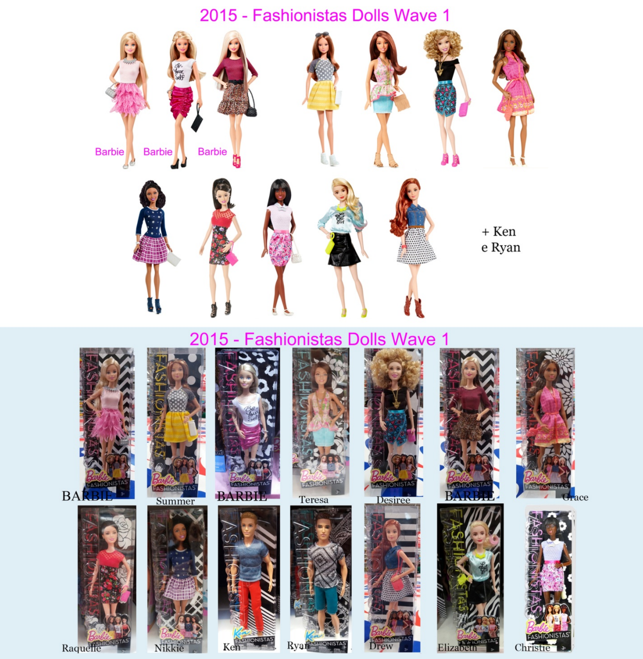
2015 - Fashionista Dolls 2015. Wave 1

Mattel completely changed the concept for the Fashionista line in 2015.