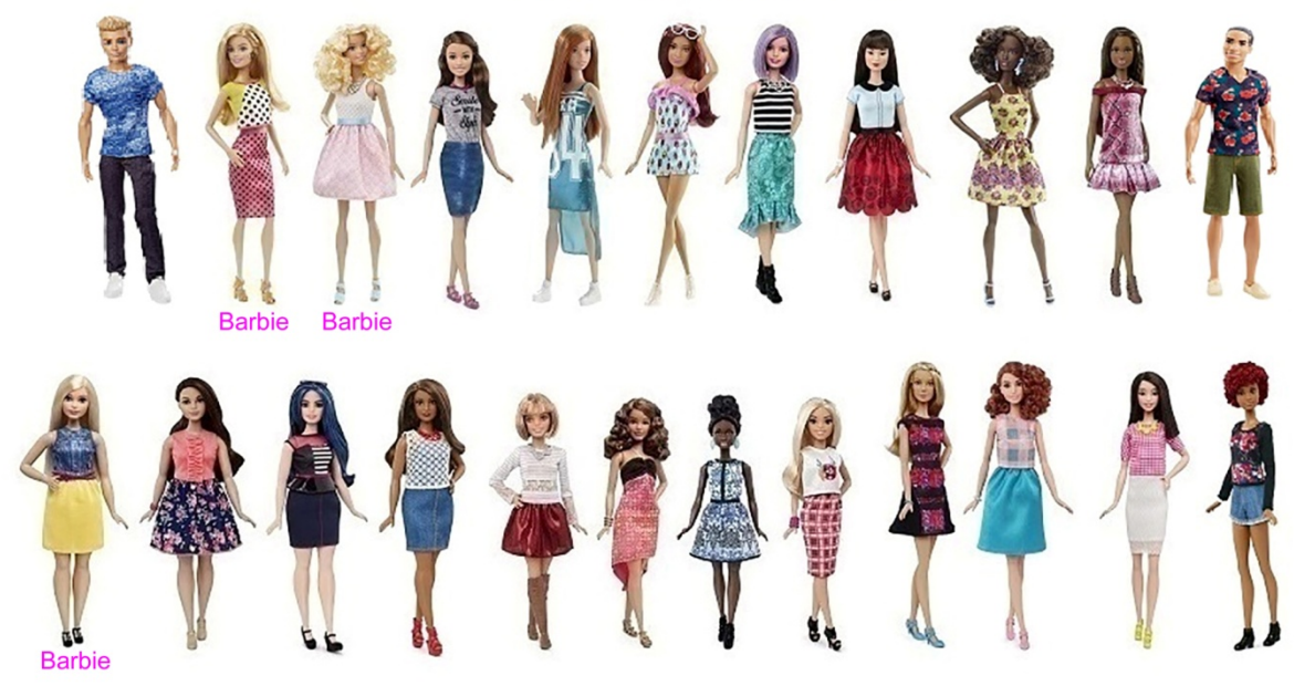
2016 - Fashionista Dolls 2016

Mattel surprises us again in 2016 with its new line of Fashionista dolls that comes to revolutionize the original concept under the slogan "Imagination comes in all shapes and sizes" and the hashtag #TheDollEvolves.