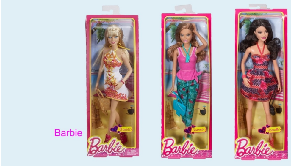
2013 - Barbie Fashionistas Tropical Dolls