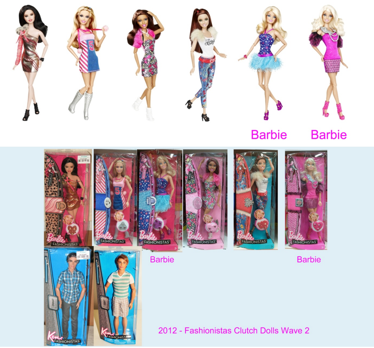
2012 - Barbie Fashionistas Clutch Dolls. Wave 2

This wave was released in the USA around February 2012 and in Europe around May - June 2012. It includes six female dolls and two male dolls: