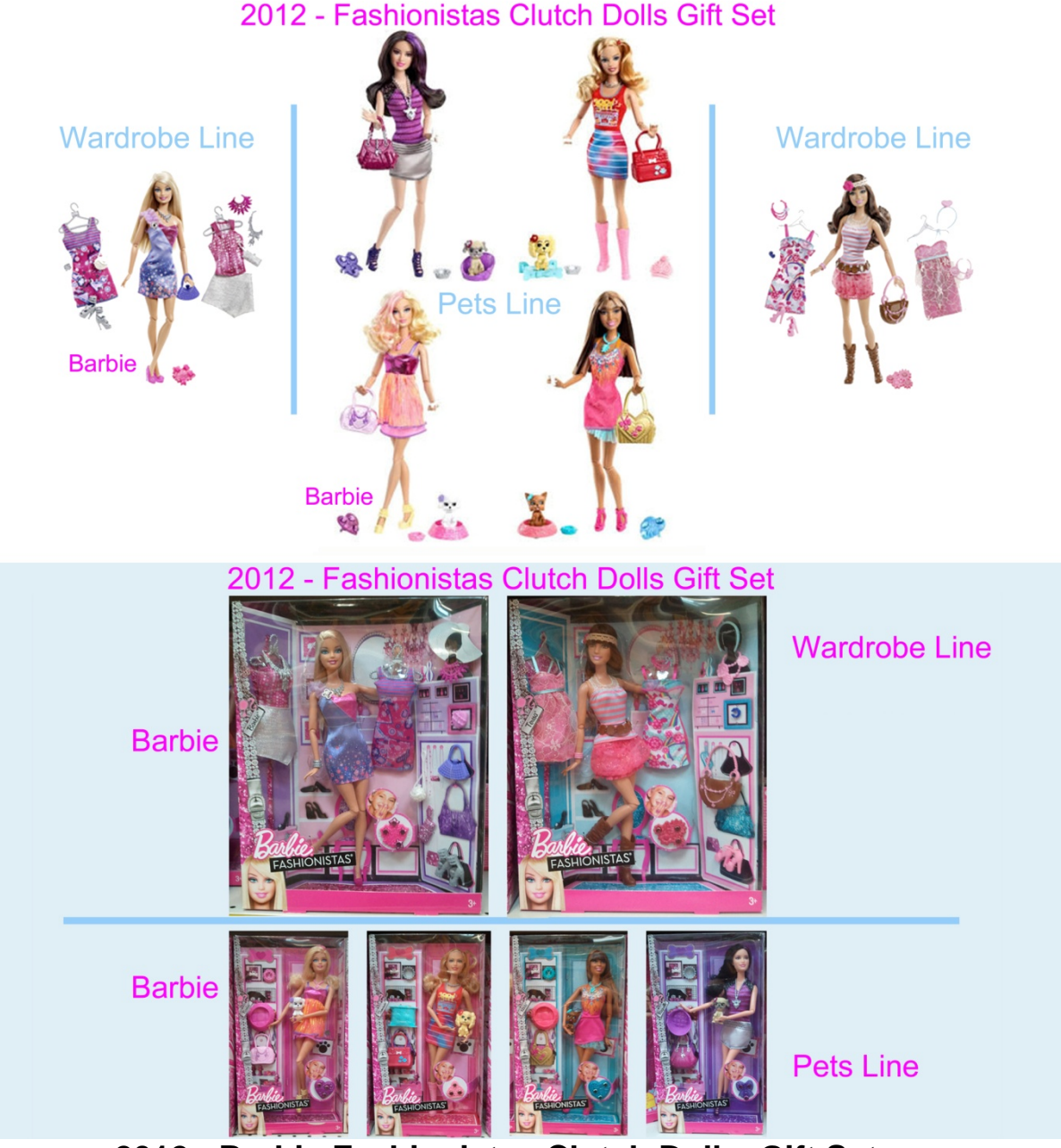
2012 - Barbie Fashionistas Clutch Dolls. Gift Sets

These sets arrived in stores around August 2012. They consist of two packs of doll with extra clothes and accessories called "Ultimate Wardrobe", and four dolls with pet: