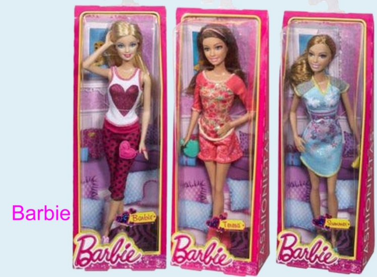
019 - Barbie Fashionistas Pajama Party Dolls

This line arrived in stores around March 2014 and contains three dolls: