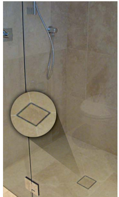
Removable Tile Tray for Easy Cleaning