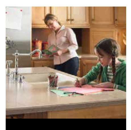
A KEY TO KEEPING YOUR COUNTERTOPS LOOKING GOOD IS TO THOROUGHLY RINSE AND WIPE COMPLETELY DRY AFTER CLEANING.

* Contact the Home Depot store where you purchased your countertop or DuPont<sup>™</sup> Corian<sup>®</sup> Certified Fabricator Installer if you are uncertain what type of finish is on your countertop.