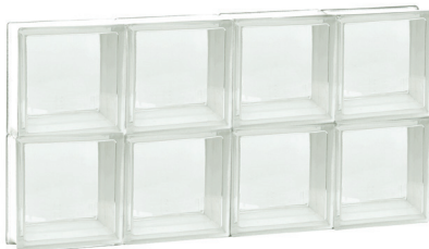
CLEAR PATTERN (CL)

Limited sizes are available in the following patterns: