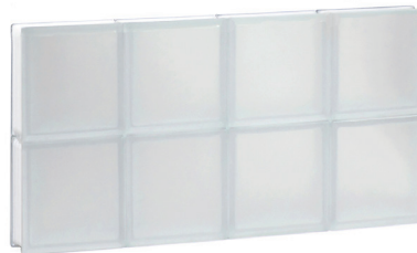
FROSTED PATTERN (FR)

MAXIMUM LIGHT, NO DISTORTION, FULL TRANSPARENCY