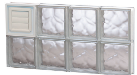
DRYER VENT (DV)

WAVE / ICE / DIAMOND / FROSTED / CLEAR: WHITE COLORED VENT BRONZE WAVE: CLAY COLORED VENT