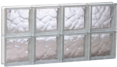
WAVE PATTERN (DC)