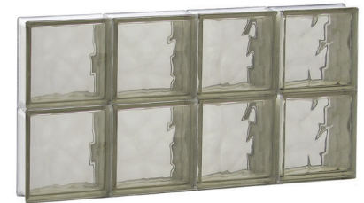
BRONZE WAVE PATTERN (BZ)

DEFUSES LIGHT, MODERATE PRIVACY WITH MATTE FINISH (PRIVACY LEVEL SLIGHTLY REDUCED WHEN WET)