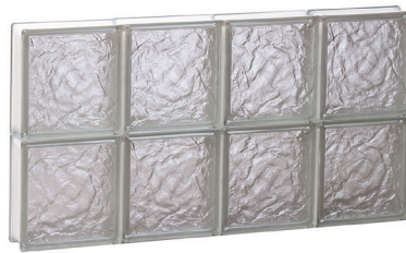
ICE PATTERN (IC)

MODERATE LIGHT WITH HIGH DEGREE OF PRIVACY