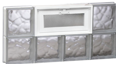
FRESH-AIR VENT (V)

WAVE / ICE / DIAMOND / FROSTED / CLEAR: WHITE COLORED VENT BRONZE WAVE: CLAY COLORED VENT