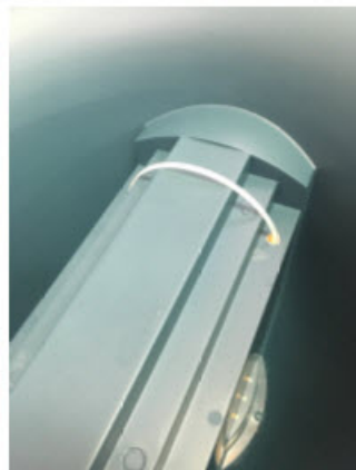
SLIDE ZIP TIE THROUGH THE HOLES.