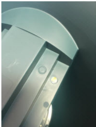
PUNCH THROUGH THE PUNCH HOLES.