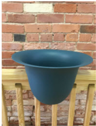
SET PLANTER ON RAILING.

[ MEASURE WIDTH OF RAILING, AND OBTAIN ZIP TIES OF APPROPRIATE LENGTH. ]