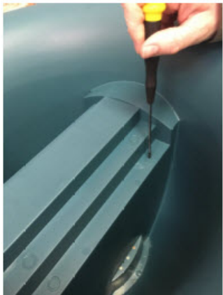
FIND A TOOL STRONG ENOUGH TO PUNCH THROUGH PLASTIC.

[ MEASURE WIDTH OF RAILING, AND OBTAIN ZIP TIES OF APPROPRIATE LENGTH. ]