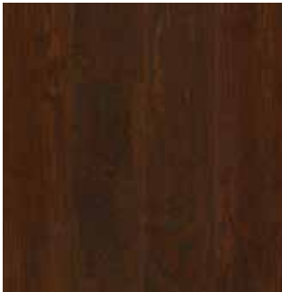
Oak Highland Trail