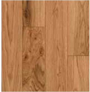
Red Oak Natural