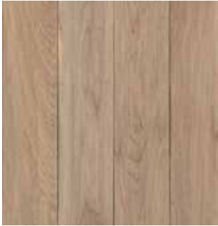
Oak By the Sea