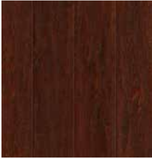
Oak Black Cherry