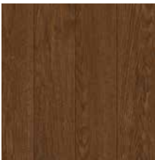
Oak Bear Creek