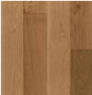
White Oak Natural