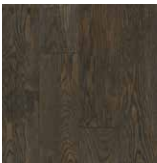
Oak Wolf Run