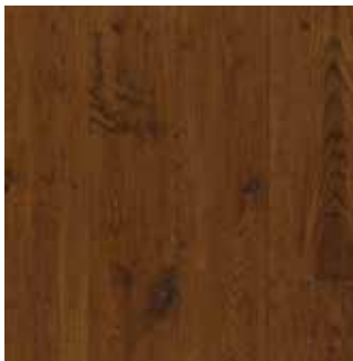
Oak Fall Classic