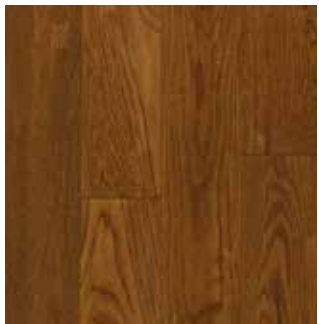
Oak Light Spice