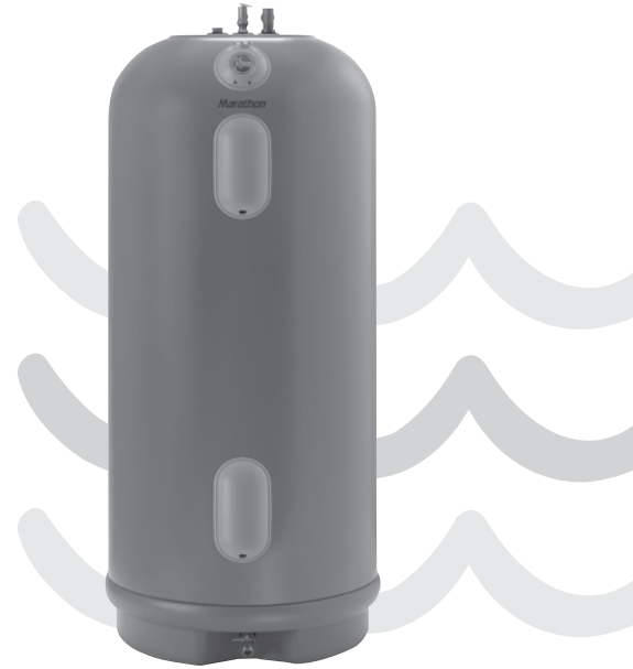
Marathon Heavy Duty 75, 85 and 105-Gallon Capacities 240 Volt AC/Single Phase Electric

Safety and Construction | These products are design certified by Underwriters Laboratories (UL) to meet UL safety standards and UL/NSF 005 as electric storage tank water heaters. All models are North Carolina and Massachusetts Code compliant. Certified for 150 PSI maximum working pressure.