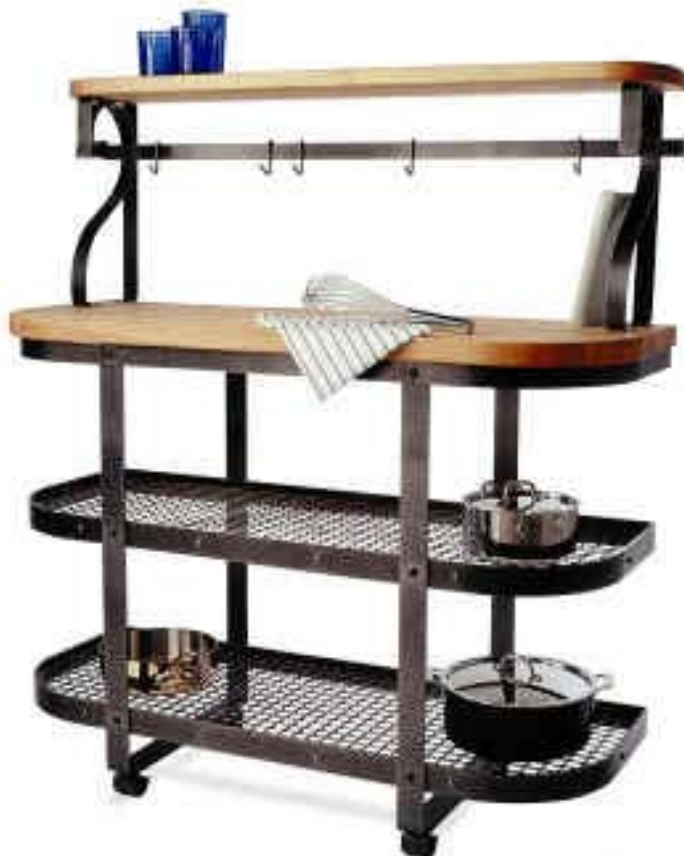
Photo: BSB1 - BSBB1 base only does not include upper shelf

See reverse side for ASSEMBLY INSTRUCTIONS