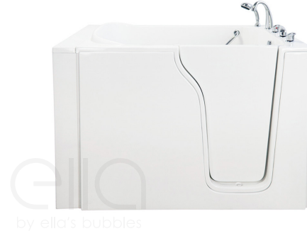
355501R Right Hand Door and Drain

Actual Size: 35" W x 55" L x 41" H Shipping Size: 36" W x 56" L x 44" H Shipping Weight: 330 lbs. Net Weight: 280 lbs. Water Capacity: 170 gal. US (unoccupied) 90-150 gal. US (occupied)