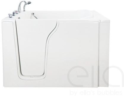
355501L Left Hand Door and Drain