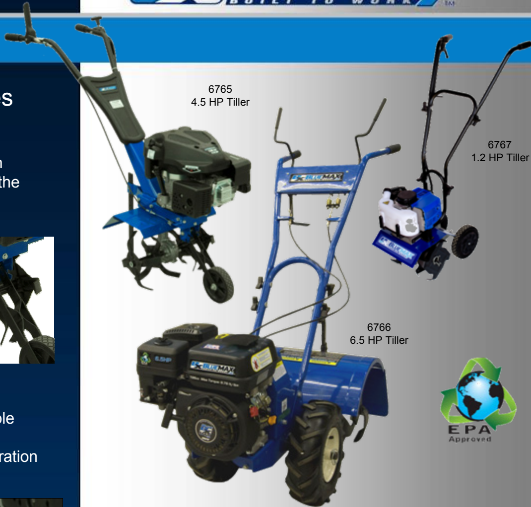
6765 4.5 HP Tiller