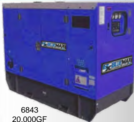
6843 20,000GF Diesel Generator