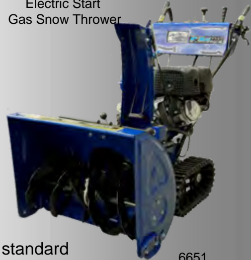
6651 Dual-Stage Gas Snow Thrower