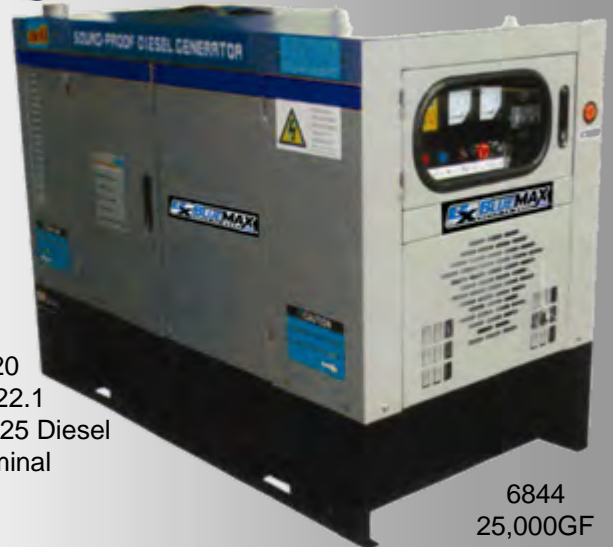
6844 25,000GF Diesel Generator