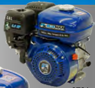
6781 5.5 hp