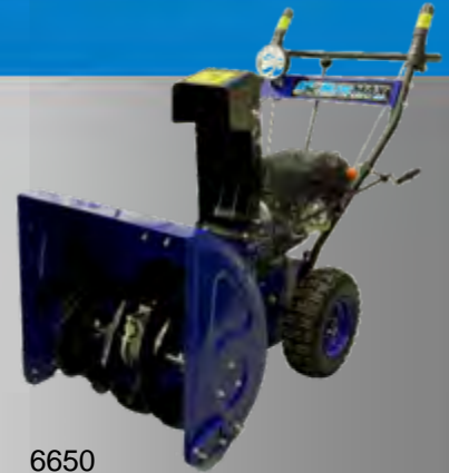
6650 Electric Start Gas Snow Thrower

•Electric Start feature is standard on the 22" and 28" models •Intake height: approx. 22in. on models 6650 & 6651