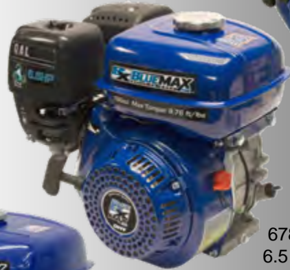
6783 6.5 hp