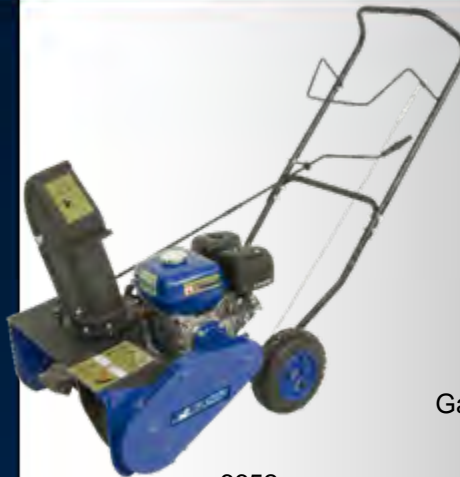
6652 Single-Stage Gas Snow Thrower