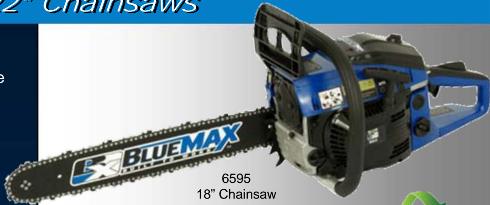
6595 18" Chainsaw