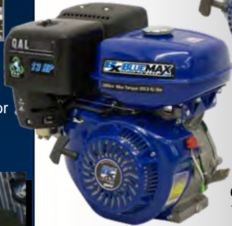
6785 11 hp