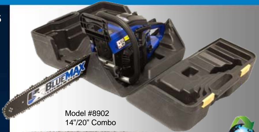
Model #8902 14"/20" Combo