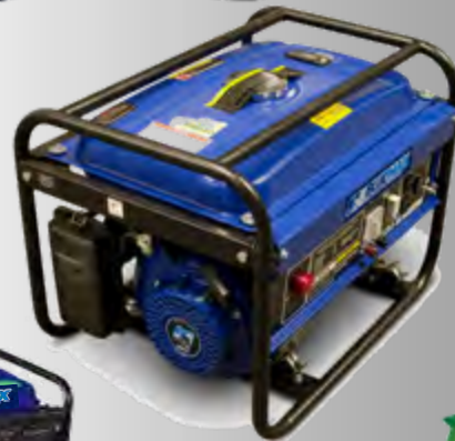
6791 4,000 W 6813 w/ electric start