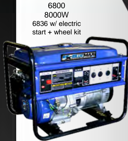
6800 8000W 6836 w/ electric start + wheel kit