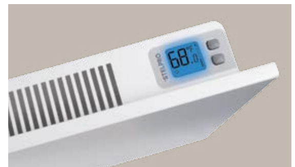
BUILT-IN ELECTRONIC THERMOSTAT AVAILABLE FOR THE 120 V TO 240 V MODELS