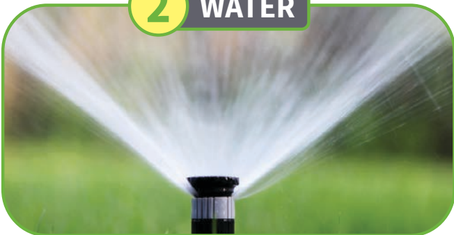
Keep Grotrax™ moist until it starts to germinate and grow.