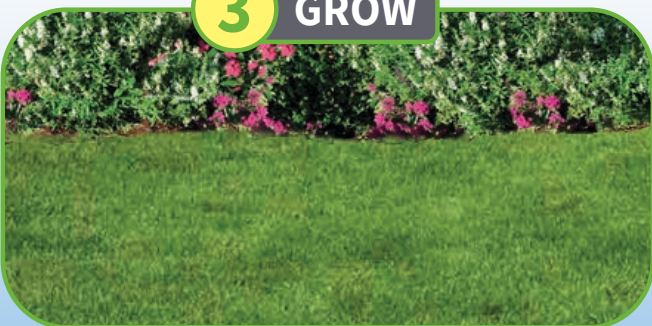
In a matter of weeks you will have a lush beautiful looking lawn.