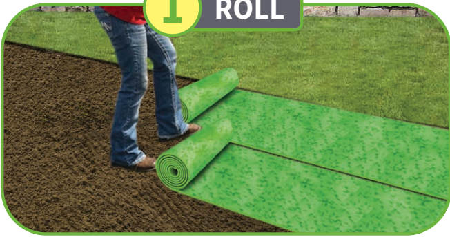
Roll out Grotrax™ on prepared surface.