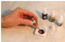
2) Drop tints into mixing bowl