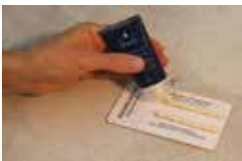
1) Squeeze required amount of putty onto mixing board