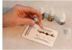
Drop tints directly into putty

Method B: Add tint drops listed in the formula directly to the putty. Next blend until putty is uniform in color.