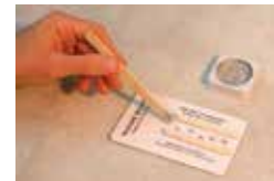
4) Dip mixing stick into the bowl and tap onto board

Method A: Add the required amount of tint drops into the bowl and mix thoroughly with the stick. Dip stick in bowl and apply mix to mixing board with a sharp tap - see photograph. Next blend until putty is uniform in color.