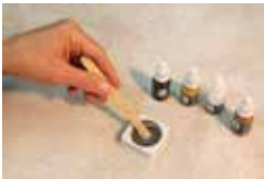
3) Mix tints well