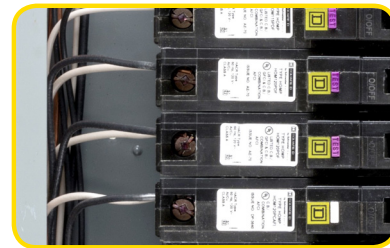
▲ Plug-on Neutral connection