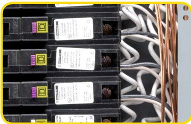
▲ Pigtail Neutral connection