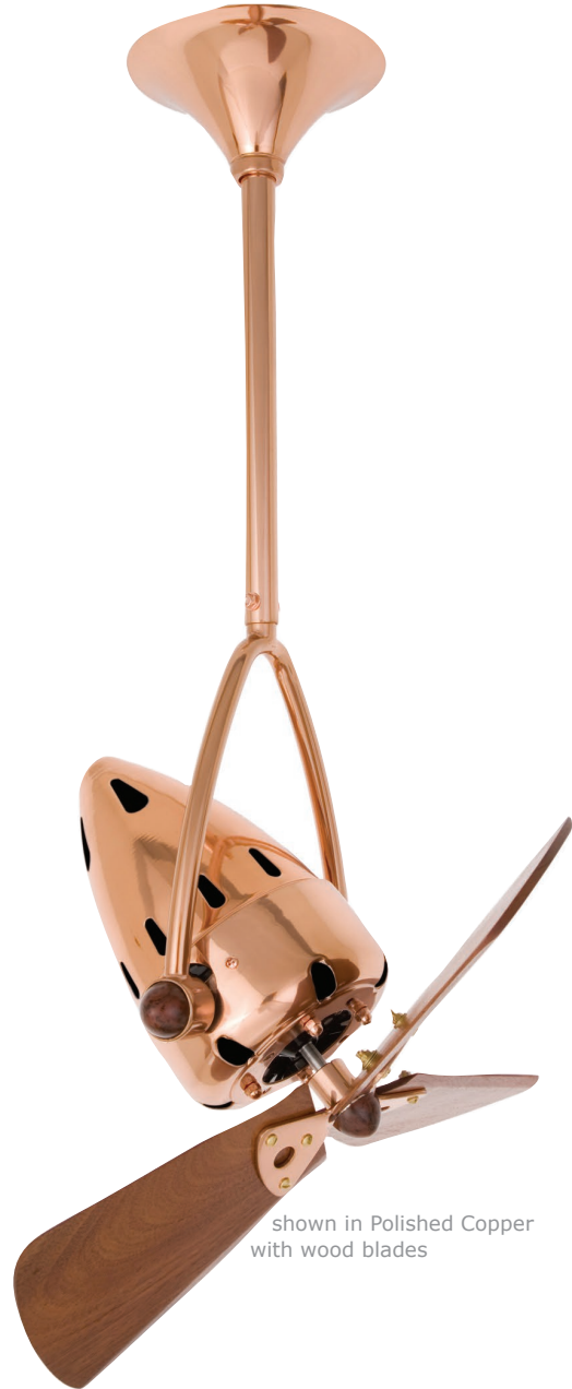
shown in Polished Copper with wood blades

Unique and versatile, the fan head of the Jarold Direcional ceiling fan can be infinitely positioned in a 180-degree arc, forward and reverse, to provide maximum, directional airflow. The Jarold can be hung in small, awkward spaces or in front of HVAC ducts to make more efficient the heating, ventilation or air conditioning of any room. Constructed of cast aluminum, heavy spun and stamped steel, the Jarold Direcional carries a limited lifetime warranty.