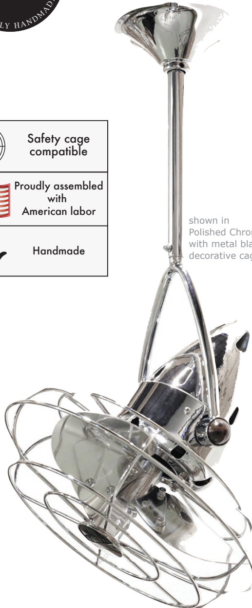
shown in Polished Chrome with metal blades and decorative cage