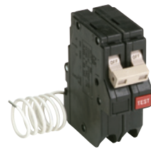
Type CH Two Pole GFCI