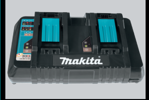
Dual port charger