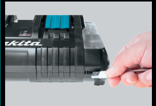
Built-in USB port for charging portable electronic devices