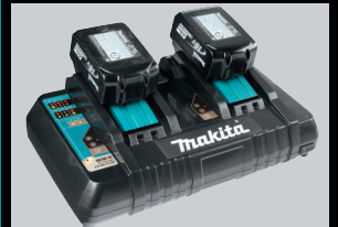
Charges 2 batteries simultaneously