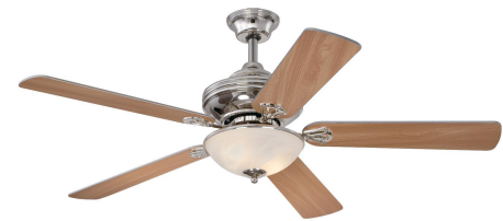
Reversible Beech Finish Blades