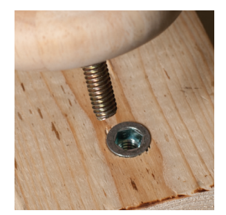
Install your new American Pro Decor bun foot.