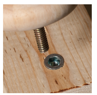
Install the bun foot.