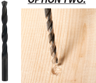
Drill a new hole approximately 1 to 1 1/8" deep using the supplied 7/6" drill bit.