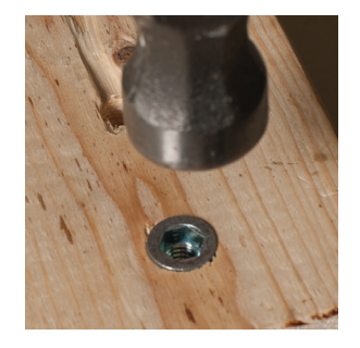
Replace with the supplied 5/16 -18" threaded insert nut. Use a hammer to tap in the insert nut.