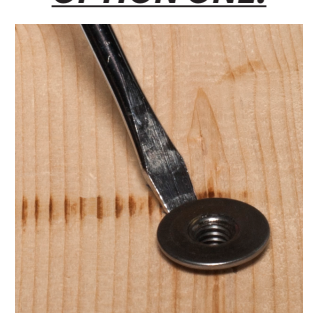
Remove the old metal insert with a screwdriver.